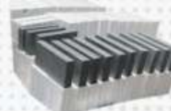
Granite Tile Box

Sy. No.807, Adj. to IE, Medchal, Hyderabad - 501401 | www.andhraexpanded.com | sales@andhraexpanded.com