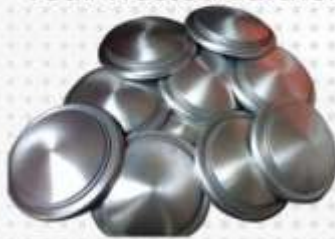
Ceiling Fan End Shield