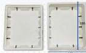
Fruit Box 5KG