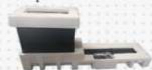
Electronic Buffer Packing