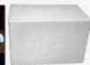
EPS Fish Box