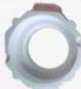
Ceiling Fan Tray