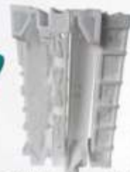
LED TV Packing Buffer