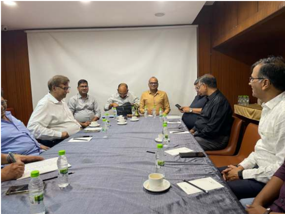
Club Assembly on 19th July 2025