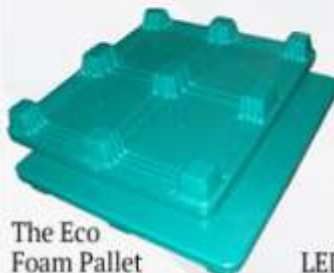
The Eco Foam Pallet