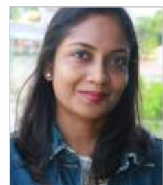
By : Ann.Kanak Kabra