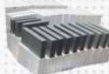
Granite Tile Box

Sy. No.807, Adj. to IE, Medchal, Hyderabad - 501401 | www.andhraexpanded.com | sales@andhraexpanded.com