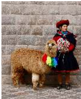
A First-Person Experience of Inti Raymi