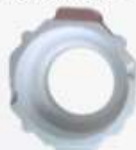
Ceiling Fan Tray