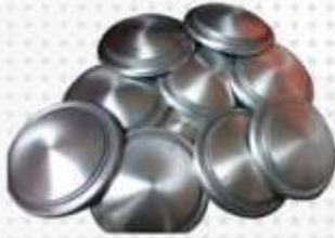
Ceiling Fan End Shield