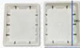
Fruit Box 5KG