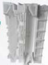
LED TV Packing Buffer